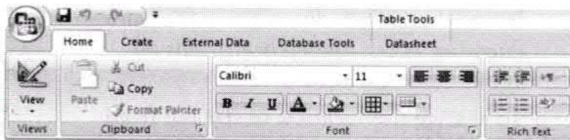
Microsoft Access ribbon